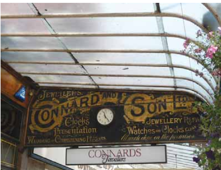
Historic advertisements add vitality and enhance the visual appeal of Southport, as well as promoting the town's commercial heritage.

The black and white colour scheme which has been adopted for virtually all the verandahs is highly practical in the sense that it is easy for neighbouring verandahs to be painted to match, despite varying ownerships. This consistency in the colour scheme enhances their character and sense of unity. To maintain the special character of the Lord Street Conservation Area, it is important that this scheme is maintained.