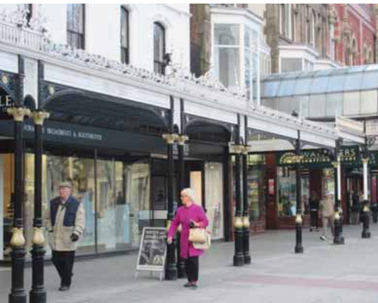
Early verandahs include supporting columns beneath spandrel brackets and an ornamental frieze.

The verandahs fall broadly into two types. The earlier verandahs have supporting columns and were designed with similar scale features, but varying decorative treatments. Columns comprise a base, column and capital, and are flanked by decorative spandrel brackets supporting a frieze (see explanatory drawing on page 8). Roofs entail narrow glazing bars running perpendicular to the building, glazed with Georgian wired glass.