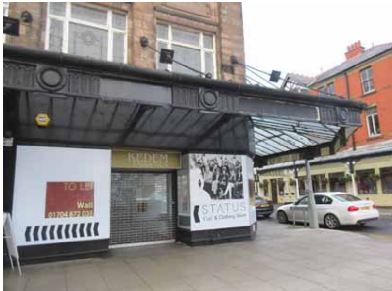
In later 20th century designs, a novel cantilevered approach was sometimes preferred and offers an unusual but attractive alternative to verandah design.

Later canopies on buildings from the early 20th century often used a cantilevered style of construction. Examples of this can be seen at the junctions of Lord Street with Coronation Walk and Bold Street, where verandahs are free of supporting columns.