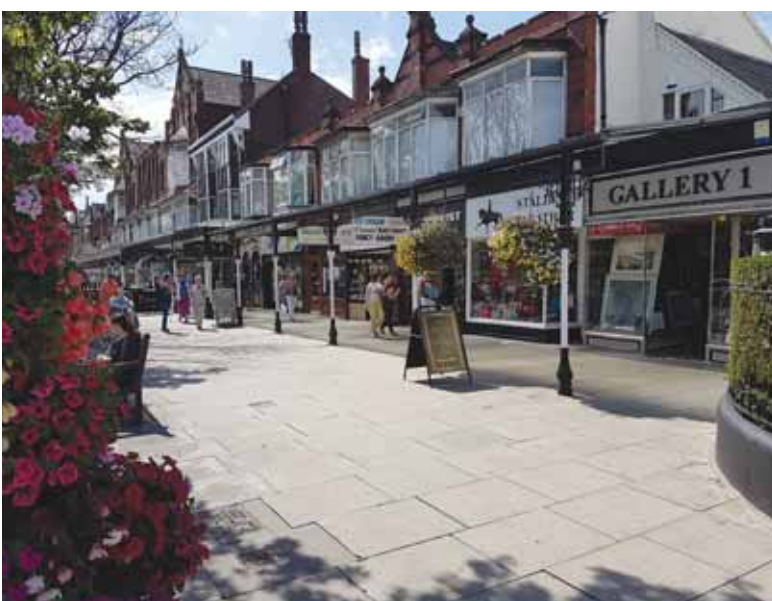
Despite their unique and individual details, Southport's verandahs remain largely similar in size and form.

A number of verandahs in Southport retain highly important historic signage which must be conserved. These panels advertised businesses that once operated from the property and are usually constructed of timber. Flaking elements of paint should be reapplied in a like-for-like manner using appropriate timber paint. Sections of damage or decay should be repaired using specialist methods and materials. Historic signs contribute to the vitality of the conservation area and are unique components in Southport's shopfronts. Contact Sefton Council before embarking on any repair work for further advice and guidance.