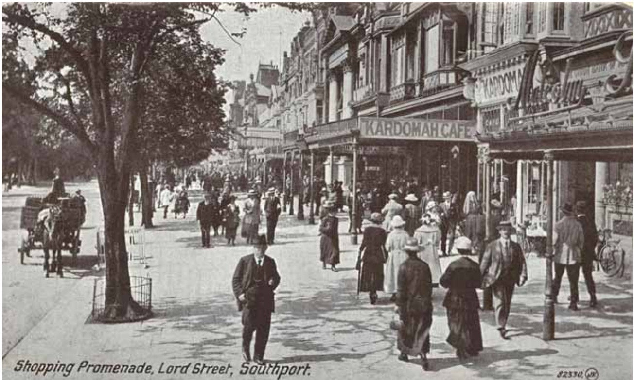
A view of Lord Street seen on an Edwardian photograph. Many of Southport's verandahs date from this period.