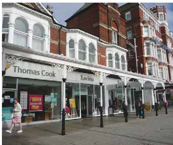
The verandahs of Lord Street benefit from a highly regimented colour scheme bringing a sense of unity and cohesive character to the locality.