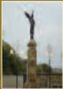
Five Lamps war memorial

As you drop down towards the entrance to the park at Beach Road, look out for some steps to your right just before the notice board, if cycling there is a sloping path just beyond. This narrow pathway has recently been surfaced and crosses the lowest point of the valley between allotments on your left and football pitches to your right,