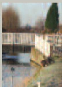
Aldrins Lane, Photograph: Peter Hodge

We start at the Aldrins Lane swing bridge to follow the towpath for the next 2km (1.25 miles) through the suburban housing estates of Netherton and Buckley Hill. The place name Netherton, comes from the Old English 'nether' (lower) and 'tun' (hamlet), being first listed as such in 1576 and was probably done so to separate it from the other local tuns, such as Thorntun, Seftun and Hightun.