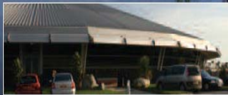
Crosby Leisure Centre

Currently this route along the Leeds-Liverpool Canal towpath ends 800 metres further on at the Pennington Road overbridge, where there is easy access to both Hawthorne Road and Linacre Road/Stanley Road.