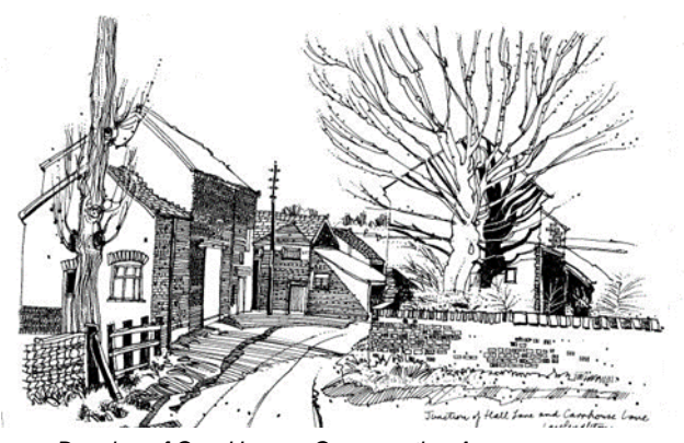
Drawing of Carr Houses Conservation Area

Planning Services Sefton Council Magdalen House, 30 Trinity Road, Bootle. L20 3N