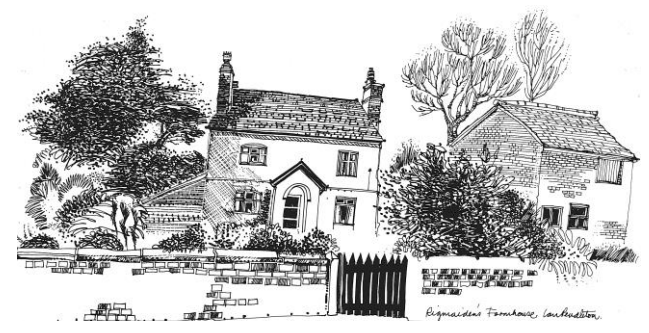
Drawing of a house inside Carr Houses Conservation Area