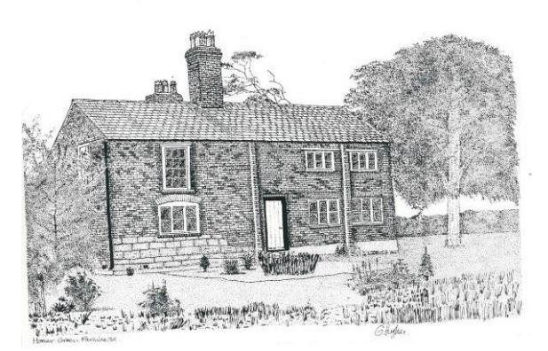
Drawing of a house inside Homer Green Conservation Area