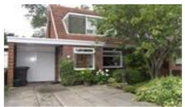
3 bedroom house currently on sale for £150,000.00

The development of these new properties in addition to the Powerhouse site would flood the local market with new builds of which we currently have many that have not sold. This would make it difficult for the current residents to sell properties and would also have an impact on the local Estate Agents who would not be used to sell the new properties as this is done via the developer initially and only when the development is complete and the developer has left would any unsold houses be passed to the local Estate Agents. There are a variety of properties currently on sale starting from £145,000 and up to £199,950 to include apartments, 2 bedroom, 3 bedroom and 4 bedrooms.