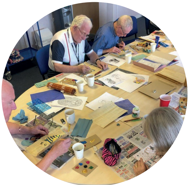
Carers Craft Group